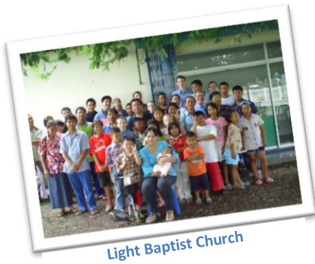
Light Baptist Church