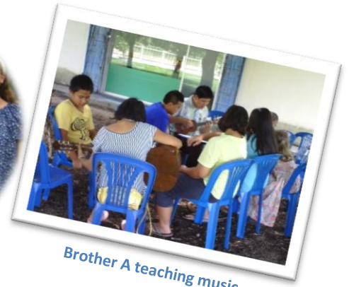
Brother A teaching music